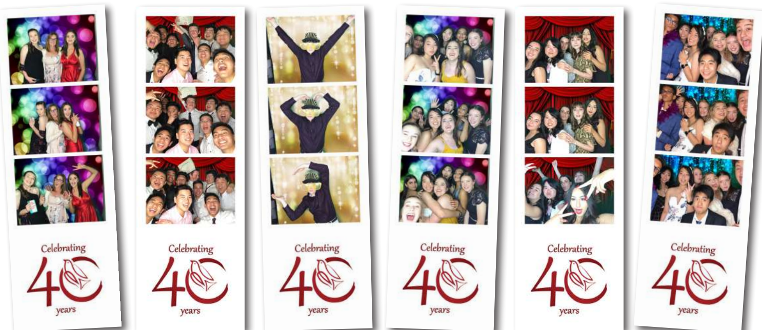
Photos from the Senior School Formal

Semester 2 for Years 10, 11 and 12 students is very important. For Year 10 students, the process of selecting subjects for 2020 will be a priority, while Year 11 students will focus on building a strong academic and leadership foundation in preparation for their final year of school in 2020. Our Year 12 students have commenced Unit 4 studies and will be completing practice examinations during the upcoming September holidays in preparation for their final examinations during Term 4. Members of the College's teaching staff and our Careers and Work Studies Coordinator have offices in the building, and are easily accessible for discussion or to meet with students. The staff at the College look forward to supporting our students during this exciting time.